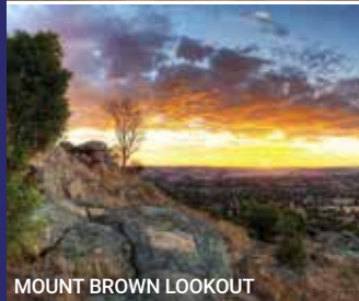
MOUNT BROWN LOOKOUT