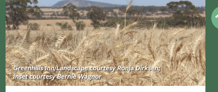
The Greenhills Heritage Trail is kindly supported by:

Take a break and rest in the shade of the gazebo – you'll find more interesting stories there.